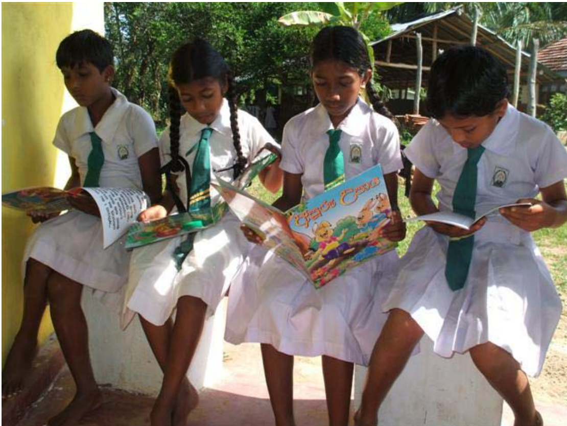
The children also enjoy reading on the veranda.