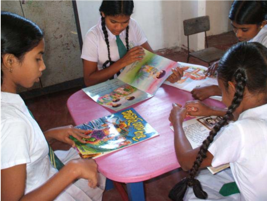
These children have selected books in their local language.