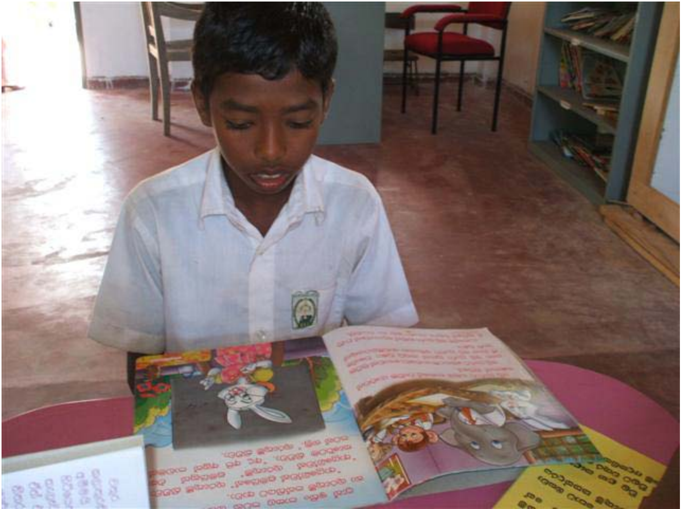
This students can't wait to read all of the books provided by Room to Read.