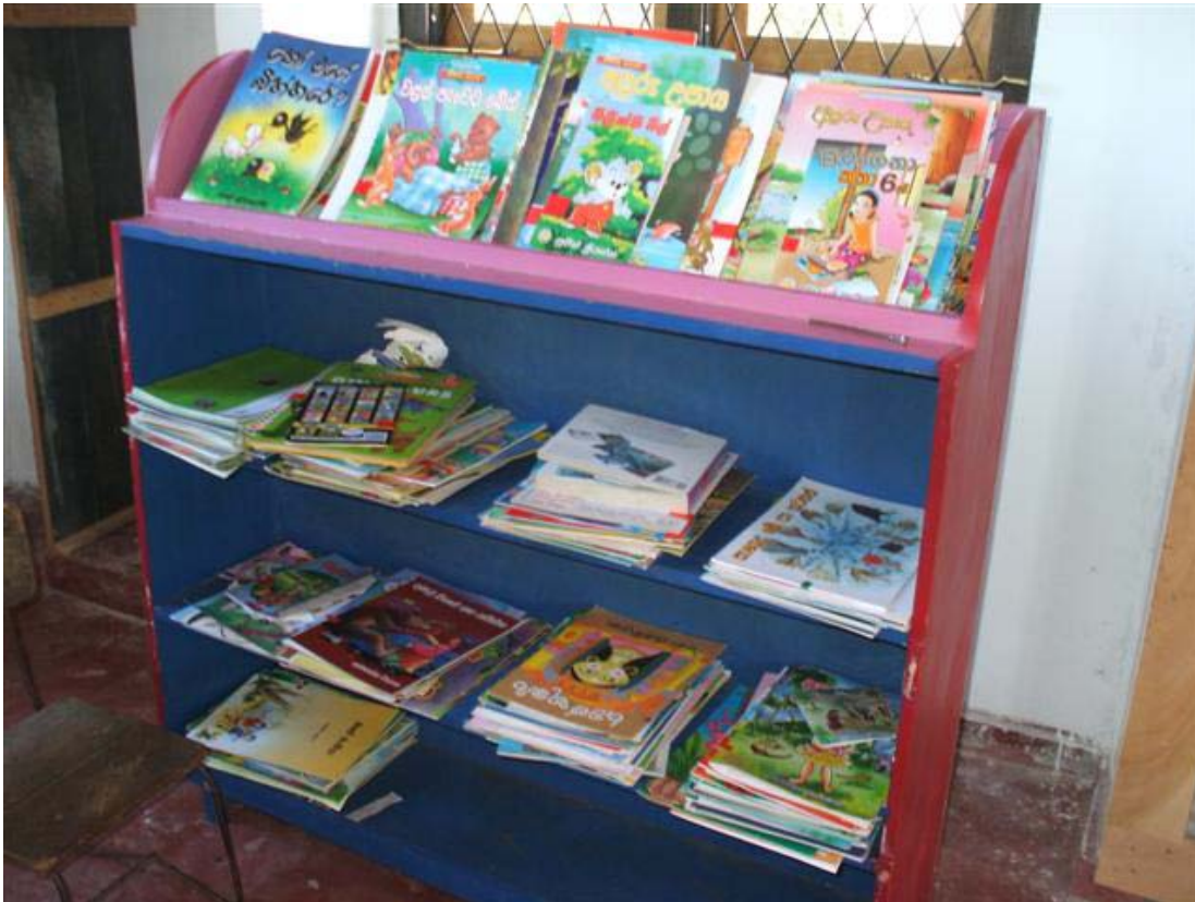
Room to Read provided shelves and many books.