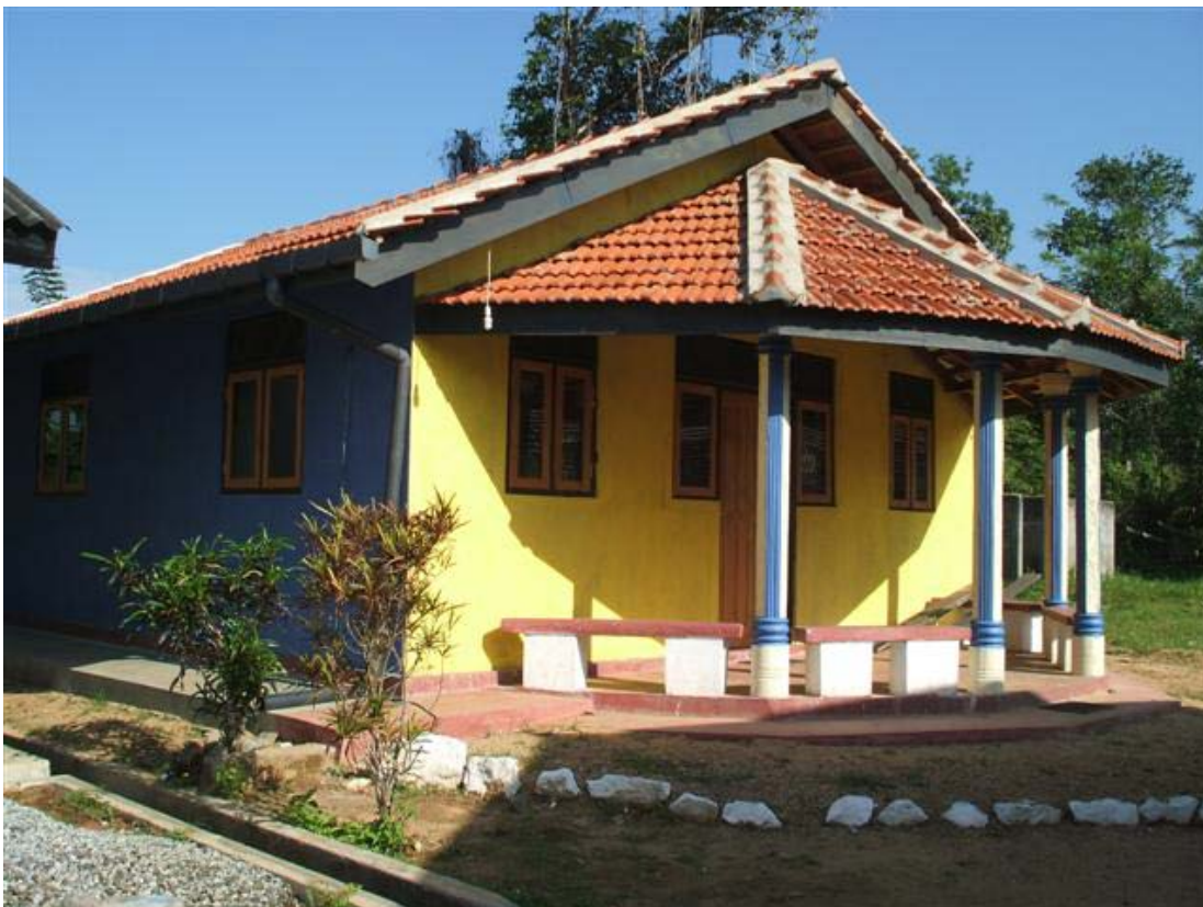
The building is painted in bright colors, making it a child-friendly space.