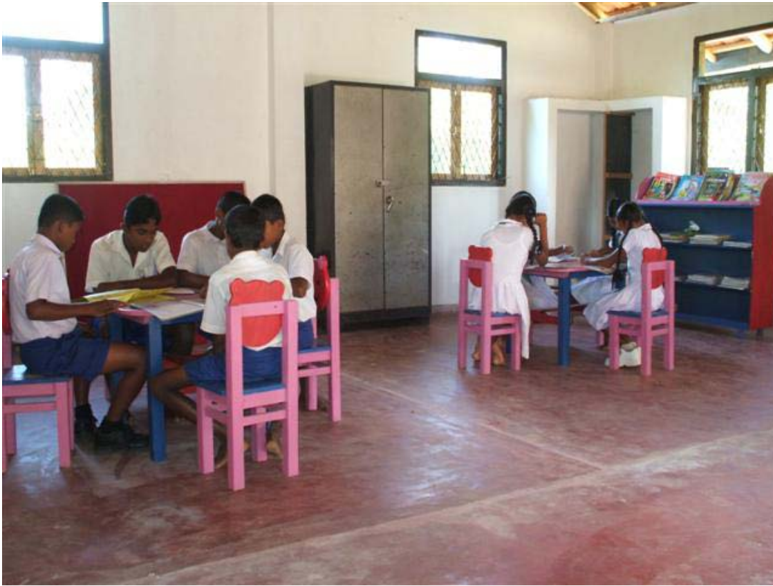
The Constructed Reading Room has a large area in which the children can read.