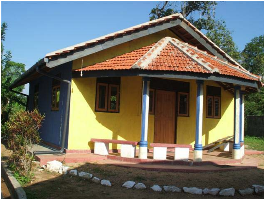
The finished Constructed Reading Room.