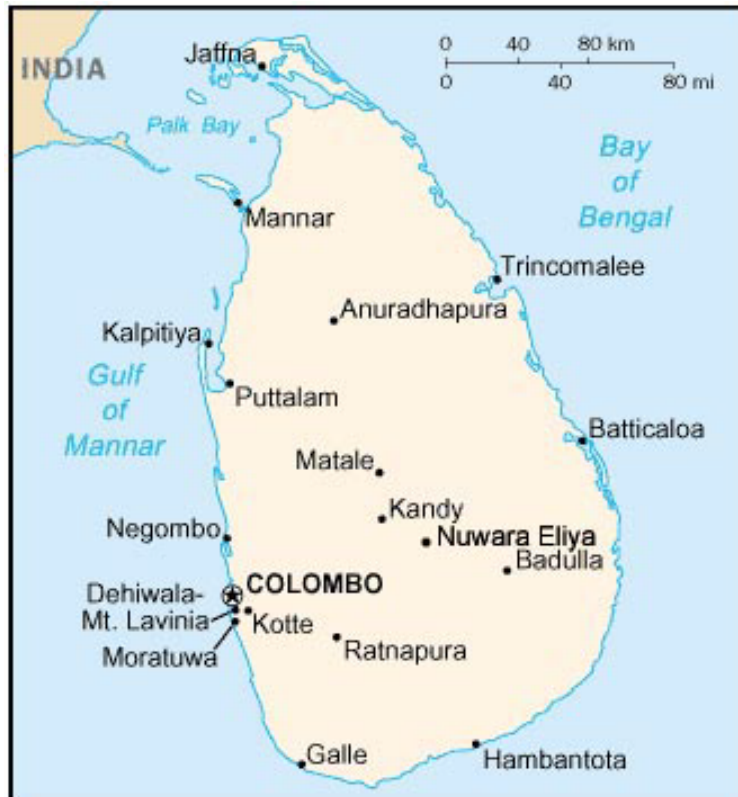
Map of Sri Lanka.

Narrow, windy, and bumpy roads in poor condition limit travel to this region. Although the trip is beautiful, the drive from Colombo takes 8 hours.